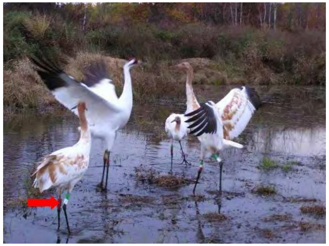
These Whooping Cranes all wear colored bands so that they can be easily identified. The arrow indicates the radio transmitter attached to the chick's leg.

Some birds also wear a transmitter that emits a satellite signal called a satellite monitored platform transmitter terminal, or a PPT. These transmitters have an antenna, but are very light (they weigh 30 grams, or a little over an ounce). The signal from the PPT is not emitted continuously. Instead, it only transmits on certain days. It will emit a signal for eight hours on days when it is transmitting. This signal allows birds to be tracked within 15 to 1,000 meters of their precise location.