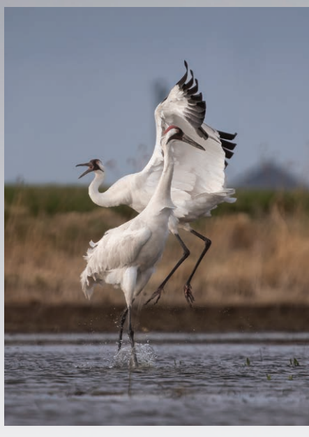
Courtship dance, Rainwater Basins, Nebraska. Michael Forsberg

ooking back over the past four years, I've traveled ✓ roughly 50,000 miles on what I call the "Whooper Highway," an ancient north-south pathway. I've accompanied these birds through the cycles of their seasons and met many people who love them. Along the way, I've amassed more than 100,000 photographs, over 50 hours of film footage, a stack of 10 coffee-stained field journals filled with scribbles and words, and an endless collection of pictures and videos on my phone. I strategically planted a dozen timelapse cameras in critical places where whoopers reside, capturing every