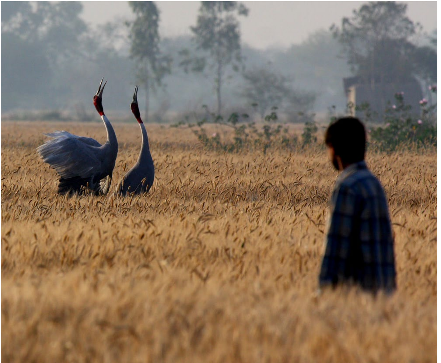
Sarus Cranes engage in a unison call while a farmer watches.

Therefore, agriculture is one of the main causes behind severe population declines for ten of the 15 species of cranes in the world, and it affects all species in one way or another. However, some agricultural uses of wetlands and grasslands, such as paddy wetlands and moderate grazing, can be beneficial to both cranes and people, providing important environmental services like water and nutrient recycling and food production, at the same time as allowing cranes to flourish. Ultimately, farming in ways that keep habitats functioning sustainably benefits both humans and cranes.