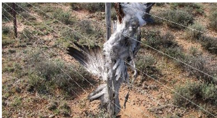
Blue Crane caught in a fence.

Loud noises, like from firearms or noise-making devices, can also keep birds away and can be used for larger flocks and are best when protection is needed over days or a few weeks, but the birds may get used to the disturbance if the sound stays the same.