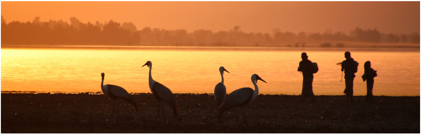
Wattled Cranes and local people at Boyo Wetland, Ethiopia.