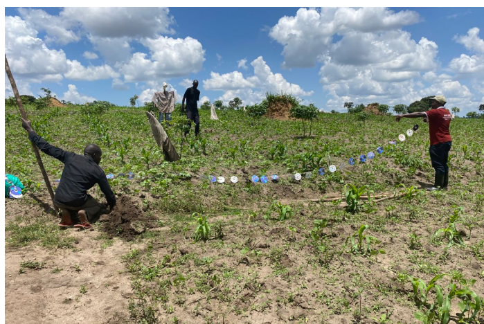
Old compact discs strung between stakes are used to try to deter cranes from feeding in a field.