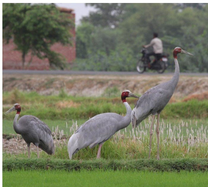
Sarus Crane and two chicks.

Programs that focus on restoring or protecting natural habitats for cranes and creating buffer zones between these areas and agricultural areas can also be used to avoid conflict between farmers and cranes. Such areas help to minimize disturbances from human activities while also providing a balance of habitat use between farmers and cranes. Developing conservation policies is an important aspect of this and can be done at a local level or a regional/national level. Increasing nesting wetlands for cranes can also increase pollinator habitat and groundwater recharge, which can also be important to farmers.