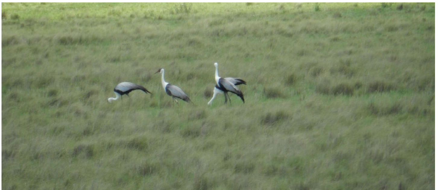
Wattled Cranes north of Bethlehem, South Africa.

During the breeding season, the breeding adults of some crane species can spend less time on agricultural land while they search for more protein-rich food (insects and other small animals, which can be more abundant in more natural habitats) to support egg development and the growth of chicks. However, non-breeding adults of those same species (which can comprise a large proportion of any given crane population) will not show this same differentiation in habitat preference. In the lead-up to migration, and during migration and winter, when full-grown cranes need to increase their energy stores, cranes tend to increase their feeding on energy-rich agricultural grains and tubers, and the whole population of a crane species may then spend more time on agricultural land.