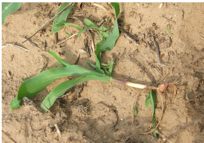
Uprooted corn plant with germinated seed still intact