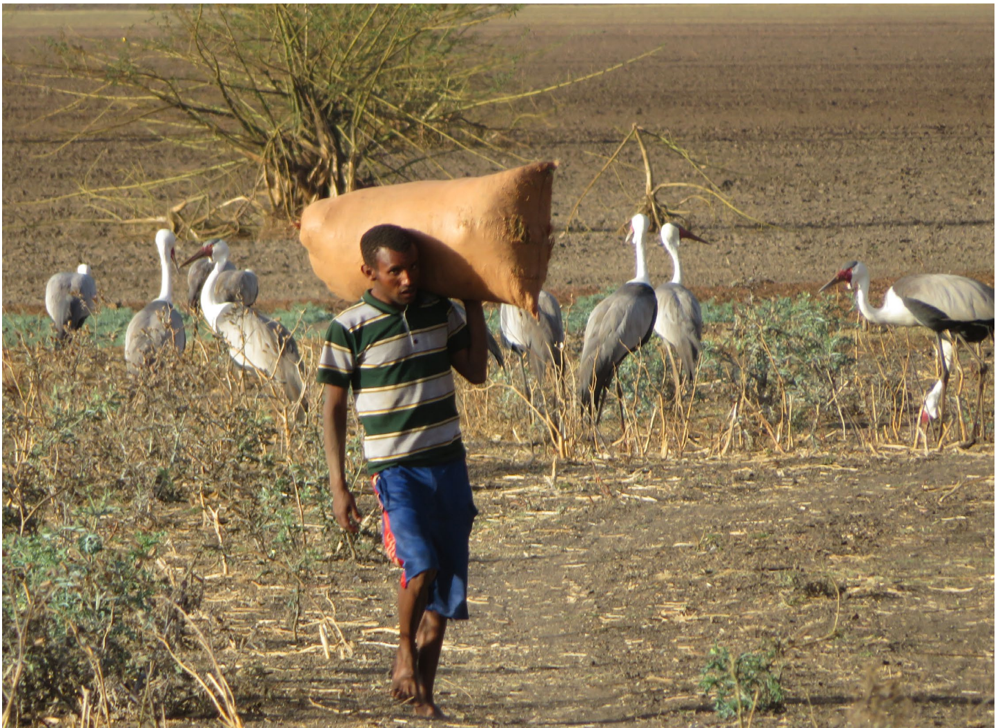
Farmer and Wattled Cranes at Boyo Wetland, Ethiopia.