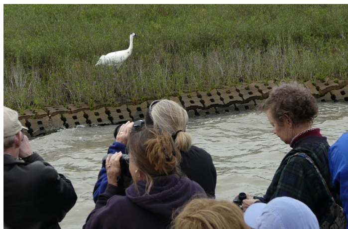
Whooping Cranes and tourists at Aransas National Wildlife Refuge, Texas, USA.