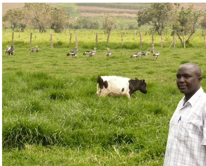
Grey Crowned Cranes and cow.

Cranes are attracted to newly sown fields where they can easily probe and pull up planted seeds or young seedlings. This damage can be prevented by chemically treating the seeds to make them taste bad to cranes. Although there is a cost for the seed treatment, this is often cheaper than the potential cost of crop damage. A particular advantage of this solution is that because the cranes still have access to the other food resources in the field (only the treated, vulnerable crop is inaccessible to them), they will often stay in the field foraging on other resources, and the risk of them moving on to other areas containing vulnerable crops is therefore significantly reduced.