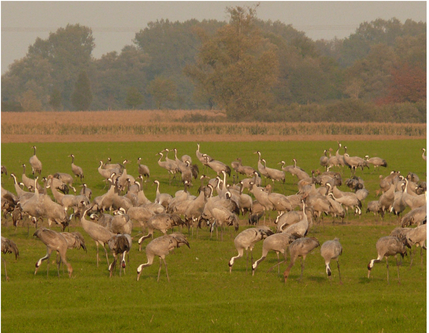
Eurasian Cranes feeding in pasture.