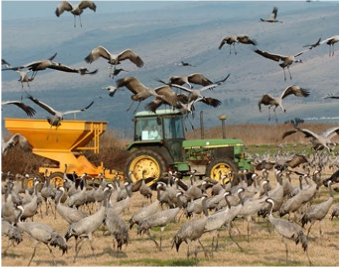
Grain is distributed by tractor to support large flocks of wintering Eurasian Cranes in the Hula Valley, Israel.