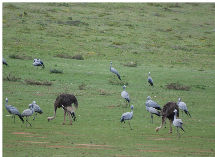
Blue Cranes and Ostriches feeding in open crop fields.

Physical barriers include fences, wires, or netting, which stop birds from flying or walking into a crop field. These measures can be effective for very small areas, but it is important to consider the potential for birds and other animals to collide or become trapped in the barrier. Fences can be combined with visual deterrents like those mentioned in the previous section.