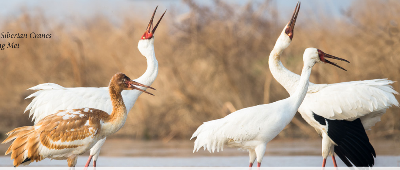
Photo of Siberian Cranes

You can help us bring people together to save cranes and the places where cranes dance!