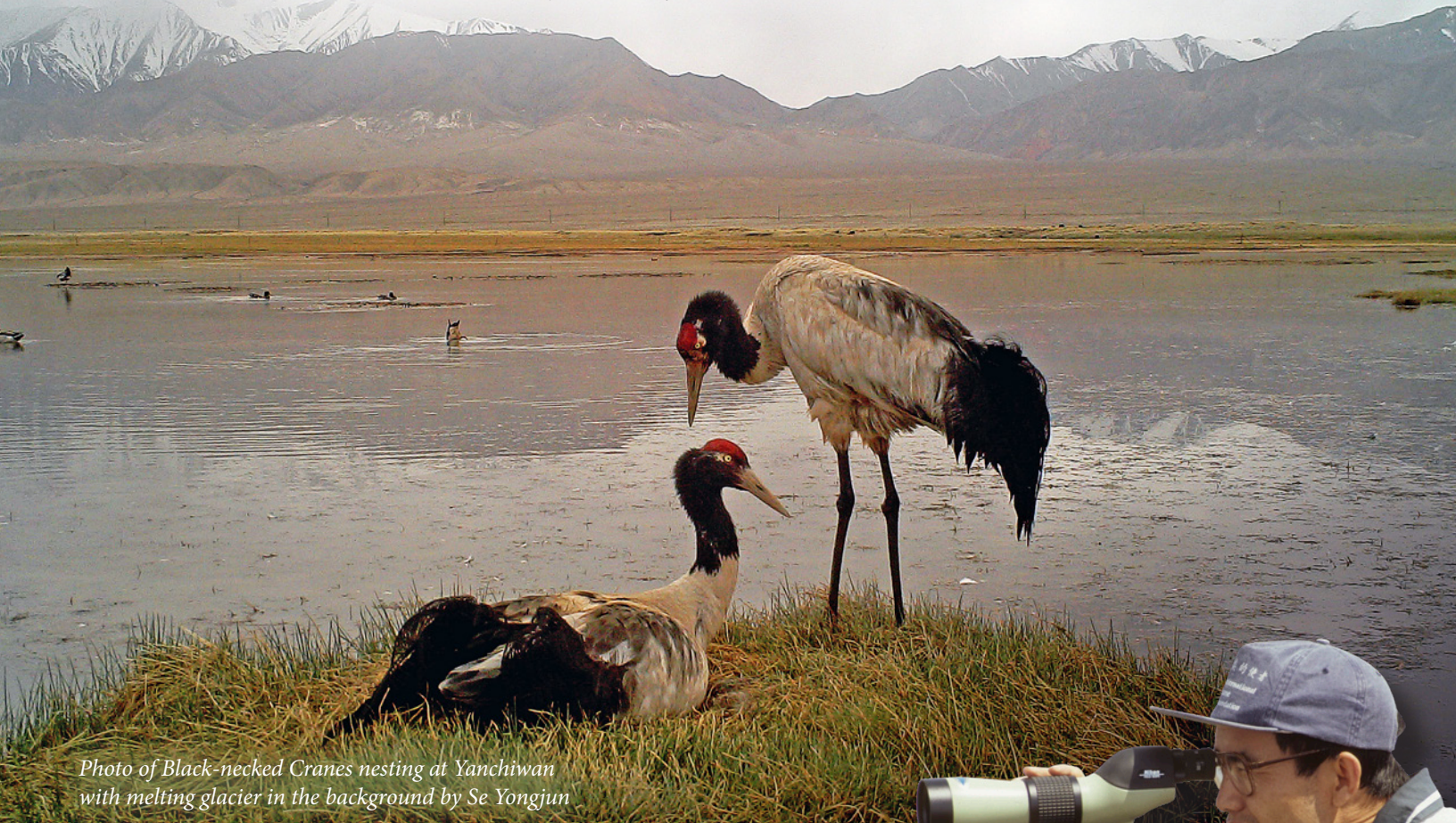
Photo of Black-necked Cranes nesting at Yanchiwan with melting glacier in the background