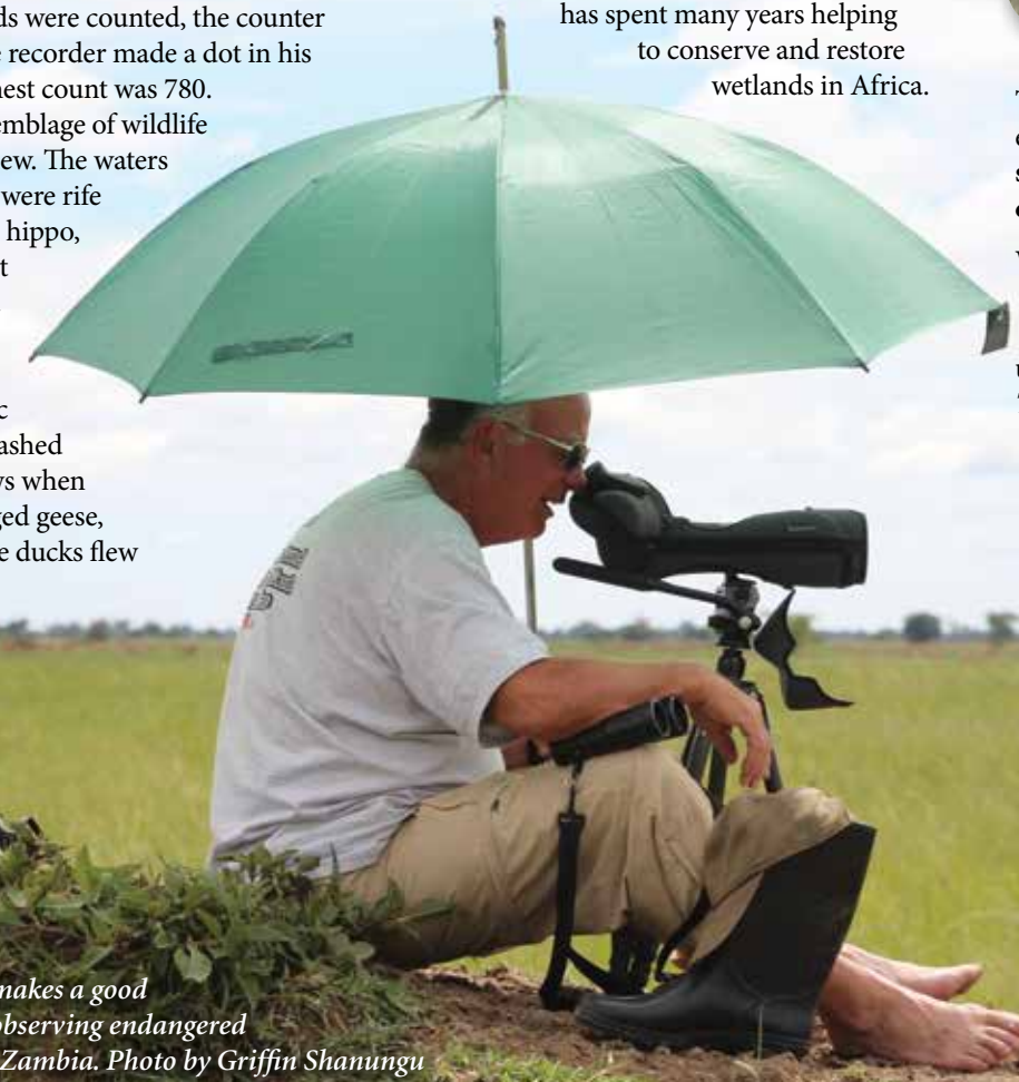
A termite mound makes a good vantage point for observing endangered Wattled Cranes in Zambia.

to feeding areas, an army in white – African spoonbills, marched in close formation through the shallows with splayed beaks probing the mud for food. They were accompanied by hundreds of black egrets that benefited from food brought into view by the spoonbills. But rather than walking with the spoonbills, the egrets flew short distances to keep up with the grand march. Dozens of huge pink-billed pelicans, a pair of noisy fish eagles, and a few Grey Crowned Cranes, perched in nearby trees. It was a wildlife spectacle perhaps enacted for eons before humans walked into the scene. Although humans have recently created problems for the remarkable ecosystem of the Kafue Flats, the actions of man also hold promise for restoration. Consequently, Griffin and I are looking forward to discussing next steps with ICF's President and CEO, Dr. Rich Beilfuss, who has spent many years helping to conserve and restore wetlands in Africa.