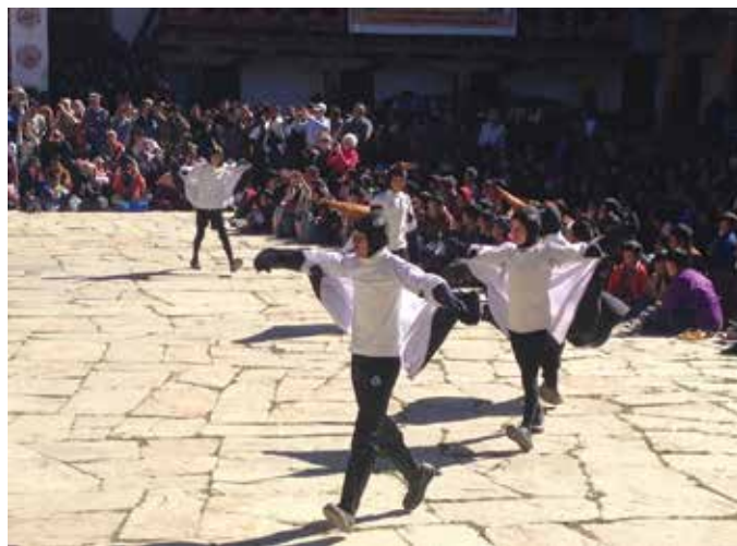
Children take flight in celebration of Black-necked Cranes.

Midway along our journey from New Delhi to Bharatpur, we pulled our bus off the highway and leapt out to scan for birds and other things that might flash in our binoculars and cameras. At first glance, these intensively farmed lands, flush with people everywhere, didn't seem a good prospect for wildlife viewing. But as the small wetlands dotting this landscape came deeper into focus, species after species appeared – a wealth of ducks, cormorants, ibises, spoonbills, storks, herons, kingfishers, and shorebirds. A herd of seven Nilgai, the largest antelope in Asia, grazed peacefully on an adjacent pasture. And then, as if following some cosmic cue, a pair of Sarus Cranes flew in and landed, with an enchanting little dance, in the center of our scene. Welcome to the SarusScape !