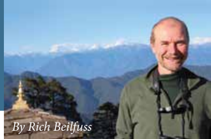
By Rich Beilfuss

Inspiring Conservation Through the Connection Between People and Cranes