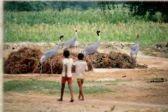
Village boys walk past a Sarus family eating waste grain from a hay pile behind a village.

The system, however, was not without danger for the cranes. Farmers with small landholdings feared for their crops and often removed the eggs of nesting cranes. Eggs were sought after by a nomadic tribe frequenting the area. Several cranes died every year due to collision with electric wires, and a few were poisoned unwittingly due to application of pesticides on crops in the fields. Over zealous boys, guarding the harvest in the fields sometimes killed young cranes while attempting to chase them away. Village