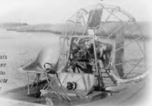
Refuge air boats like this one are the only way to reach the remote location of the wintering Whooping Cranes.

shore - well within leaping distance of a hungry bobcat. Occasionally, my only choice is to listen to the sounds of their radio signals, get a location and hope they have learned to choose safe areas to roost. Driving back to the dock, I hope I don't flush them off a good roost when I pass by. We will see what tomorrow brings. Each day is different, each day both the cranes and I learn something new.