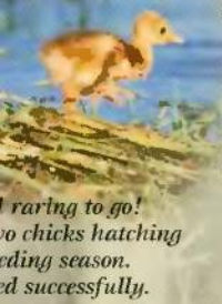
...raring to go! Two chicks hatching during nesting season. ...d successfully.

drained water from the fields. At this time rodents took over, and the critters caused an enormous amount of damage to the crops. But the Sarus ate incredible quantities of the rodents from the crop