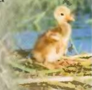
Just hatched at Another nest with in the 2000 by Both chicks fled,