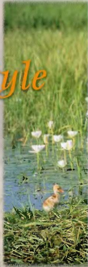
Wetlands are crucial habitats ing, but also for building nests

I decided to focus my studies in the densest Sarus populated area over approximately 900 square kilometers. Thanks to decades of sympathetic coexistence with the farmers, the Sarus were exceedingly tame and most lived beside main roads without fear. I etched out a road route for the study of 250 kilometers in length. Along this route lived about 150 territorial pairs, and four large natural marshlands housed about 1,500 congregating Sarus. Initially, I was slightly worried about discovering enough nests to satisfy the purposes of the project, but my fears were unfounded. On July