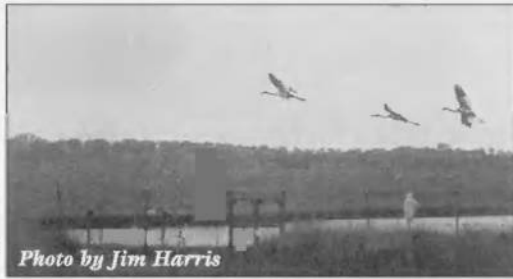
Fresh food and water are provided to the Whooping Cranes in their predator proof pen at Florida's Chassahowitzka National Wildlife Refuge.

UPDATE In December, a bobcat killed one of the young Whooping Cranes. While we live-trapped and relocated the animal the next day, bobcats are still present and definitely pose a threat to the birds. Although the costumed caretakers are visiting the small flock twice a day, the survival of these released birds will ultimately depend on their alertness and use of safe habitats. Last year, the Whooping Crane Eastern Partnership performed an experimental release of Sandhill Cranes to test methods in preparation for Whooping Cranes, but we could not practice the wintering portion of the Whooping Crane project because Sandhills do not winter in salt marshes. Last year's birds lived in a very different setting on the mainland. While we hope all the birds this year will survive, this first year is a learning experience. Reintroductions take years of efforts, and include hard lessons. One measure of this year's success will be the knowledge we gain so we can improve next year's effort and the long term survival of this rarest of all cranes.