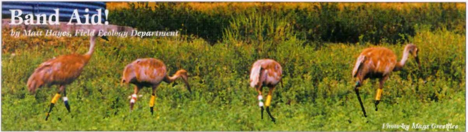
A banded Sandhill Crane family near Briggsville, Wisconsin.

Our annual Midwest Sandhill Crane Count will happen on April 13, 2002. In addition to the normal count activities, this year we are hoping to discover where many of the banded chicks from our Briggsville study have dispersed. We are encouraging Crane Counters to spot the banded cranes. Counters who send in band sightings will receive a gift certificate to Culver's Restaurant and an ICF family membership