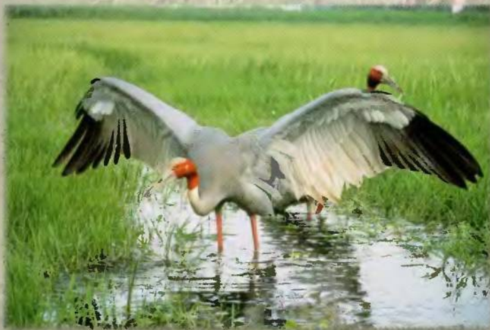
A male gestures threateningly as the author approaches the nest, while the female stands behind. Decades of coexistence have ensured that the Sarus of Etawah and Mainpuri do not run from humans at first sight.