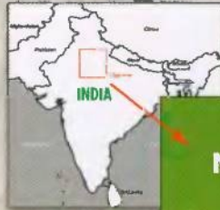
Maps by Zoe Rickenbach

I discovered a Sarus population that still appeared far removed from these dangers. In the districts of Etawah and Mainpuri, lying about 100 kilometers east from the Taj Mahal, a landscape appeared to have evolved for the sole purpose of housing Sarus Cranes. After the survey, it became apparent that these two districts had the highest populations of Sarus Cranes in the subcontinent. A study was