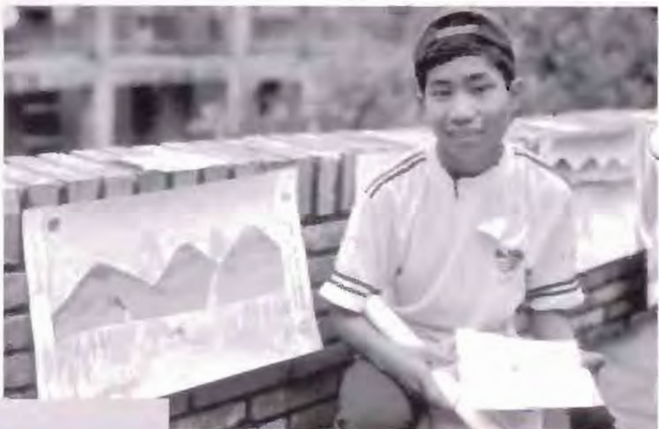
Participants in the "Crane: the Bird of Peace" art exchange are excited that their art will be traveling around the world... through ICF to a school in Wisconsin.

survival of Sarus in Nepal and neighboring India has been largely due to the belief that if a crane nests in a farmer's rice paddy, it will bring good luck to the crop. Traditional beliefs and values that once defended the Sarus, however, are slowly giving way to modern technology that