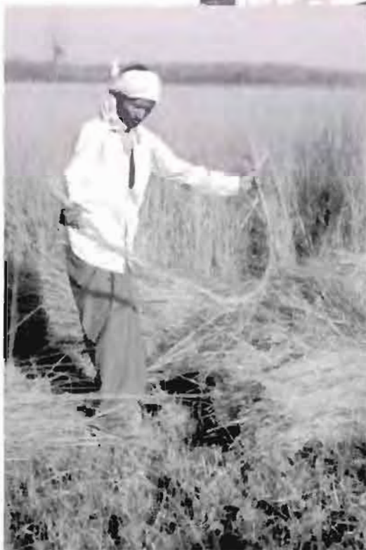
Cutting grasses at Lumbini helps manage wildlife habitat and benefits villagers too.

The Sarus Crane—the world's tallest flying bird—is the only resident crane species of South Asia, and fewer than 500 remain in Nepal. The