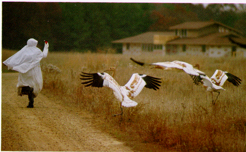
At ICF, there's a special relationship between people and cranes. In 1992, crane costumed keepers reared eight Whooping Cranes for release in Florida. These cranes strengthened their aerial abilities by flying over ICF's restored habitats. And while the chicks grew, ICF's new Scott International Guest House and Training Center also took shape nearby.

We look forward to sharing with you, our members, our continued progress. We are optimistic that we can help make this world a better place for cranes and other creatures of the vanishing wetlands and grasslands. Thank you for helping to convert our dreams into conservation realities.