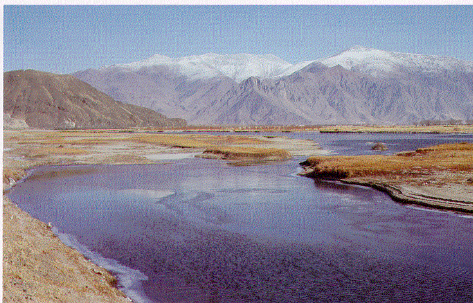
The valley of the Lhasa River is one of several in southern Tibet with critical importance for Black-necked Cranes. Here barley fields provide winter food, while shallow river channels serve as nighttime roosts. In Tibet and elsewhere across Asia and Africa, ICF programs increasingly emphasize integrating needs of wildlife and local peoples. Agricultural practices will shape the future for Black-necked Cranes in Tibet.

Although the cranes nest in the most remote parts of the Tibetan Plateau, winter forces them down into snow-free valleys populated by people. The cranes have accommodated to agriculture for centuries, as the Tibetans love cranes and other wild birds. But here, as elsewhere across Asia, rural traditions change, threatening the old balances with wildlife.