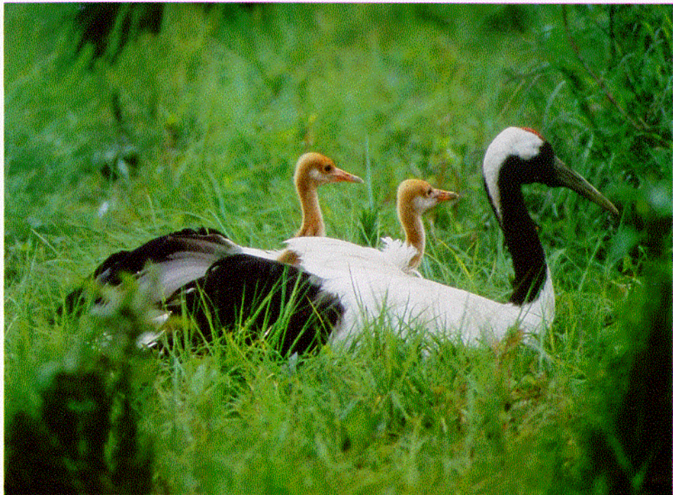
A wild Red-crowned Crane broods its young in a marsh on the Japanese island of Hokkaido. The essence of ICF's mission is to ensure there will always be cranes in the wild.