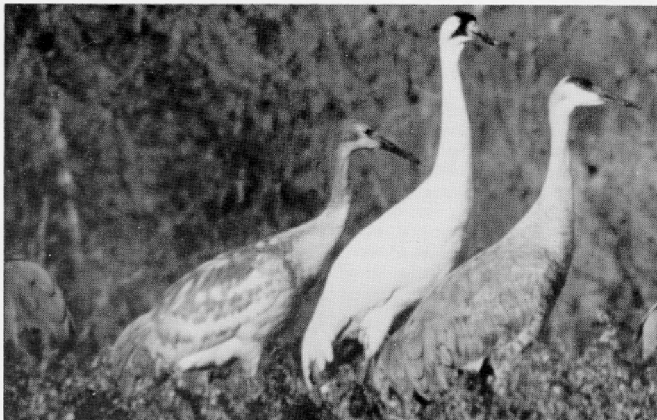
A male Whooping Crane, a female Sandhill Crane, and their hybrid "Whoophill" offspring appeared together near Bosque del Apache National Wildlife Refuge, New Mexico, in November of 1992. This is the first known occurrence of Sandhills and Whoopers crossing in the wild, although several hybrids have been produced by artificial insemination at Patuxent Wildlife Research Center.