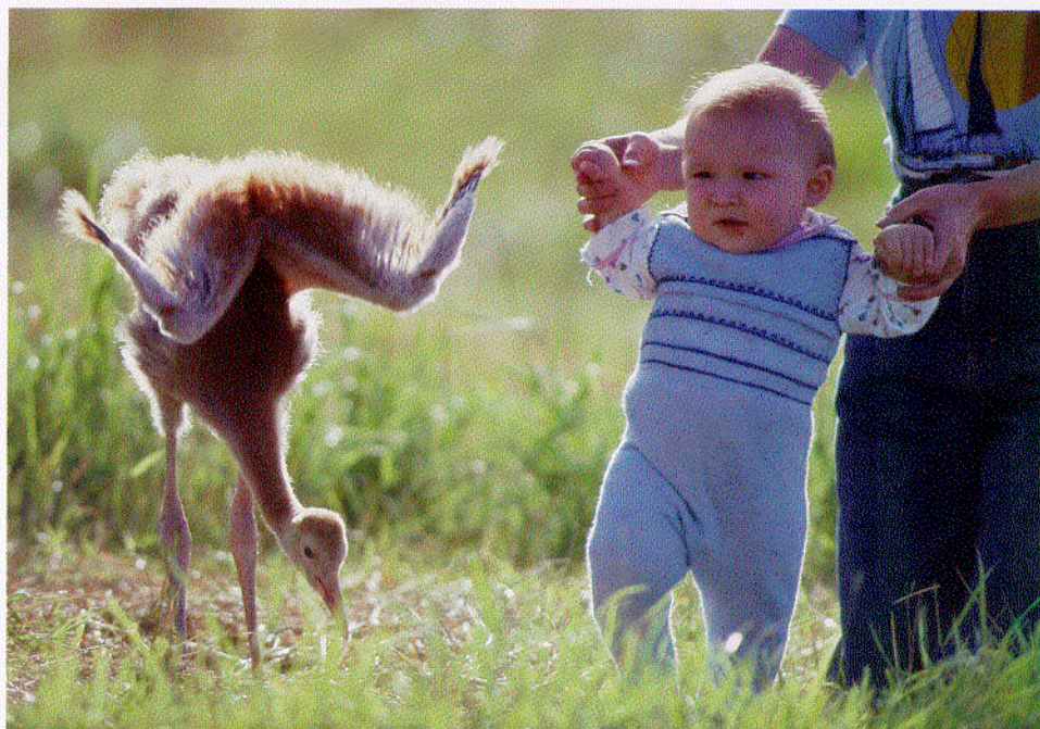
ICF started as a dream of two young men, and so we remember how important dreams are. Children are the hope for the future. At ICF, we make a special effort to nurture the young. Here, a baby meets a Red-crowned Crane chick at Khinganski Reserve in Russia.

ICF programs are managed by four departments. The International Department creates and coordinates overseas programs. The Field Ecology Department studies wild cranes and restores habitats both at ICF headquarters and abroad. The Education Department manages 30,000 annual visitors, organizes field trips and classes (see pages 6-7), administers the Wisconsin Crane Count, handles public relations, produces this newsletter and is now exploring the possibilities of helping nature reserves in Russia and Vietnam through teacher workshops and through