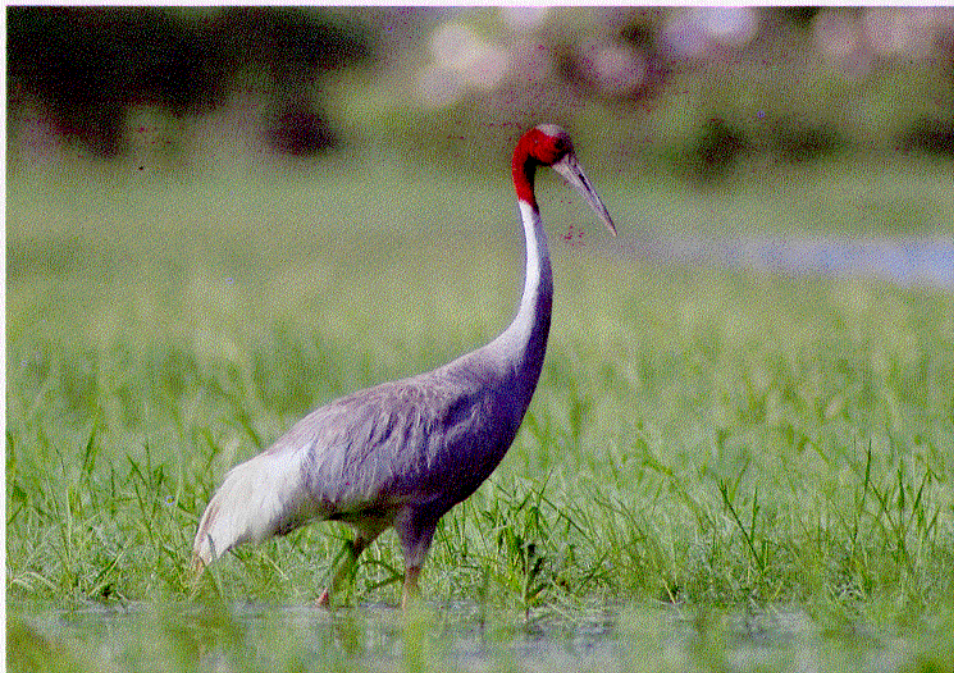
Small wetlands still support nesting Sarus Cranes at Lumbini. Farmers nearby believe the nesting cranes bring good harvests to the rice paddies.

The Lumbini site is a small area with multiple functions. Its development is guided by a Master Plan laboriously prepared with involvement of 13 nations. The Master Plan cannot be changed even with the discovery of cranes. But ample natural areas were left undeveloped in the plan, and these can be places for cranes, eagles, and all the other birds.