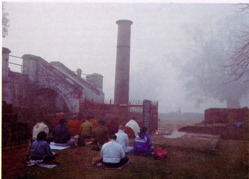
An ancient pillar stands in southern Nepal at Lumbini, the birthplace of Buddha. Pilgrims meditate here, and large numbers of birds live within this three-square-mile shrine to international peace and harmony. Lumbini, and the farmlands surrounding it, are the most important areas left for Sarus Cranes in Nepal.

The Development Trust purchased three square miles of lowland Tarai and moved