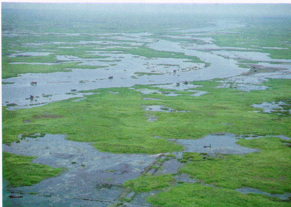
About 79 percent of Cambodia's surface is covered by natural habitats—forest, savannah, grassland, open water, and rivers. Thanks to this abundance of relatively undisturbed ecosystems, Cambodia is southeast Asia's last stronghold for the Eastern Sarus Crane and a variety of other endangered wildlife.