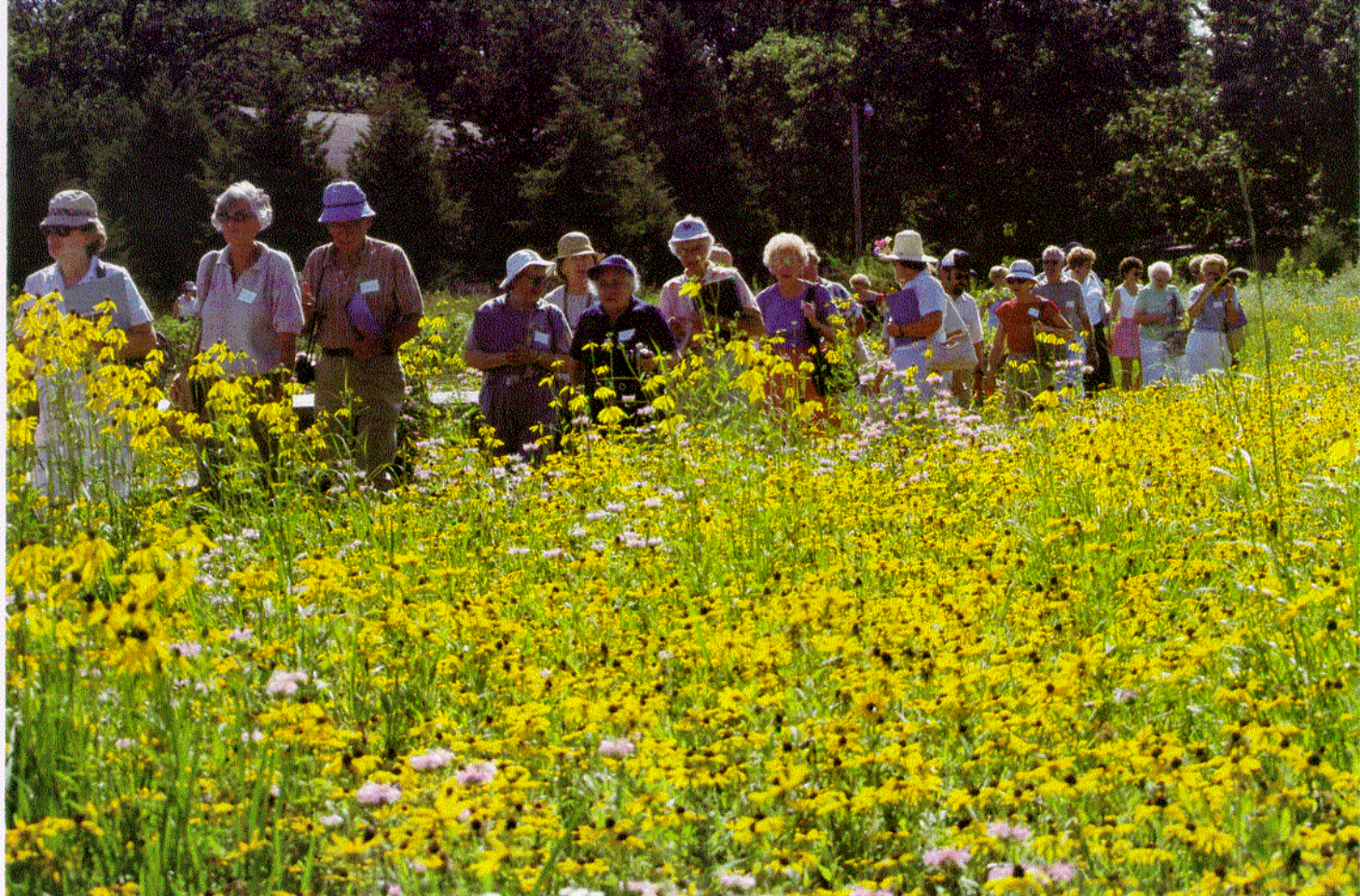
ICF's restored prairie is a kaleidoscope of color. Come walk on our trails, or enroll in a workshop! Find out what biodiversity is all about!