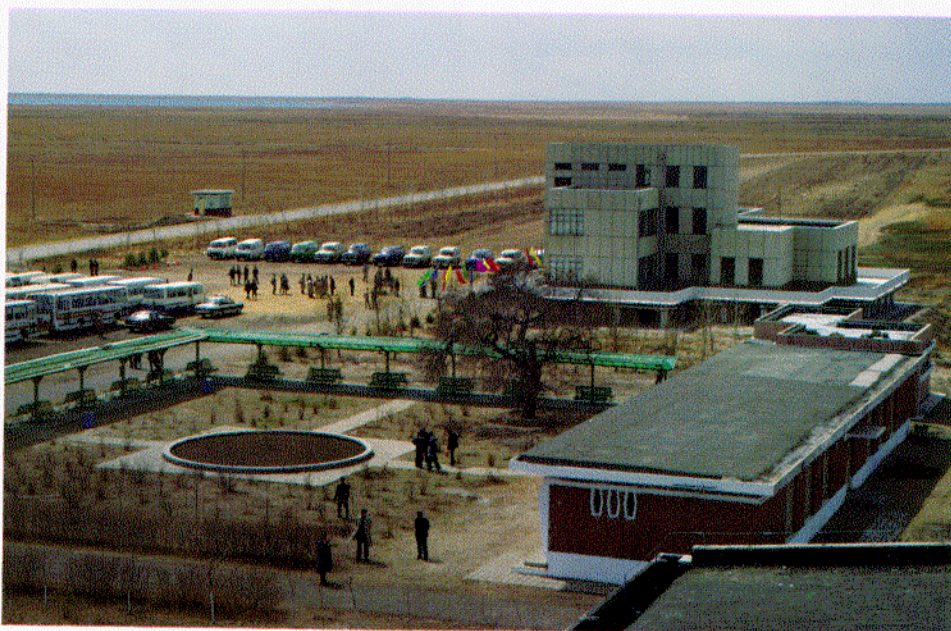
The headquarters at Zhalong Nature Reserve contains an impressive array of facilities for research and visitor education. The visitor program is so successful, however, that careful planning is essential. Otherwise, the marsh surrounding the headquarters will be degraded, and its value for education lost.

Zhalong offers an important lesson for conservationists elsewhere. In northeastern China, as in so many countries, conservation problems will remain intractable so long as different groups define their interests narrowly and ignore the other values of wetlands. The key is for one group to look at the wetland as a whole, including all values and uses, and to define a long-term future that can sustain the needs of the people. When one group gains that vision—as the Zhalong reserve and then the city of Qiqihar did for the Zhalong wetland—swift agreement and progress become possible.