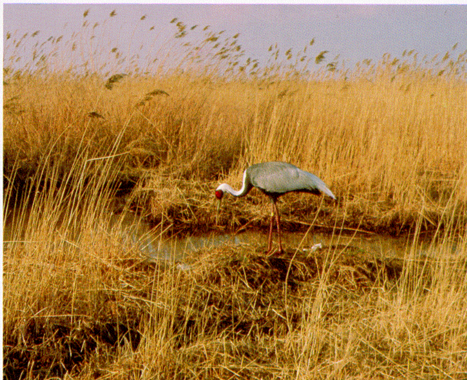
White-naped Cranes and five other crane species depend on Zhalong Marsh. In recent years, however, the wetland has been overused and degraded by human activities. The city of Qiqihar is coordinating a new cooperative effort at management, involving all governmental units concerned with the marsh. This approach offers hope that prime crane habitat can be conserved while meeting needs of the people.