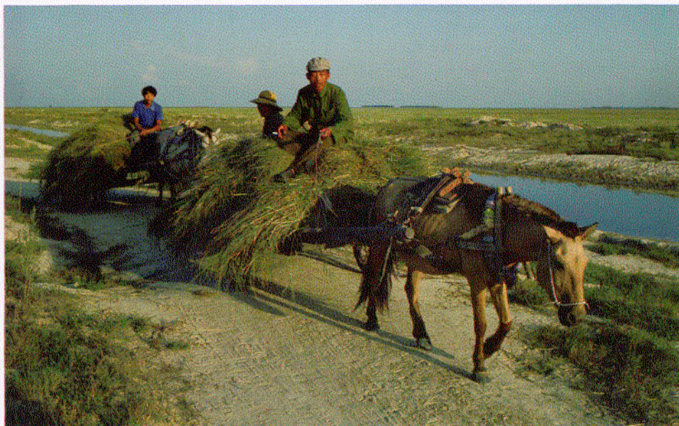
Recent policies in China have encouraged individual initiatives, so that the villagers at Zhalong are using marsh resources more intensively. If the people conserve their marsh to provide long-term benefits, the wildlife also will thrive.

Managers at Zhalong Reserve have long been aware of the impact that human activities have had on the cranes and other birds. As they attempted to persuade other agencies to correct the problems, however, conflicts quickly appeared between the needs of birds and of people. Fishermen, for example, traveling throughout the marsh disturb