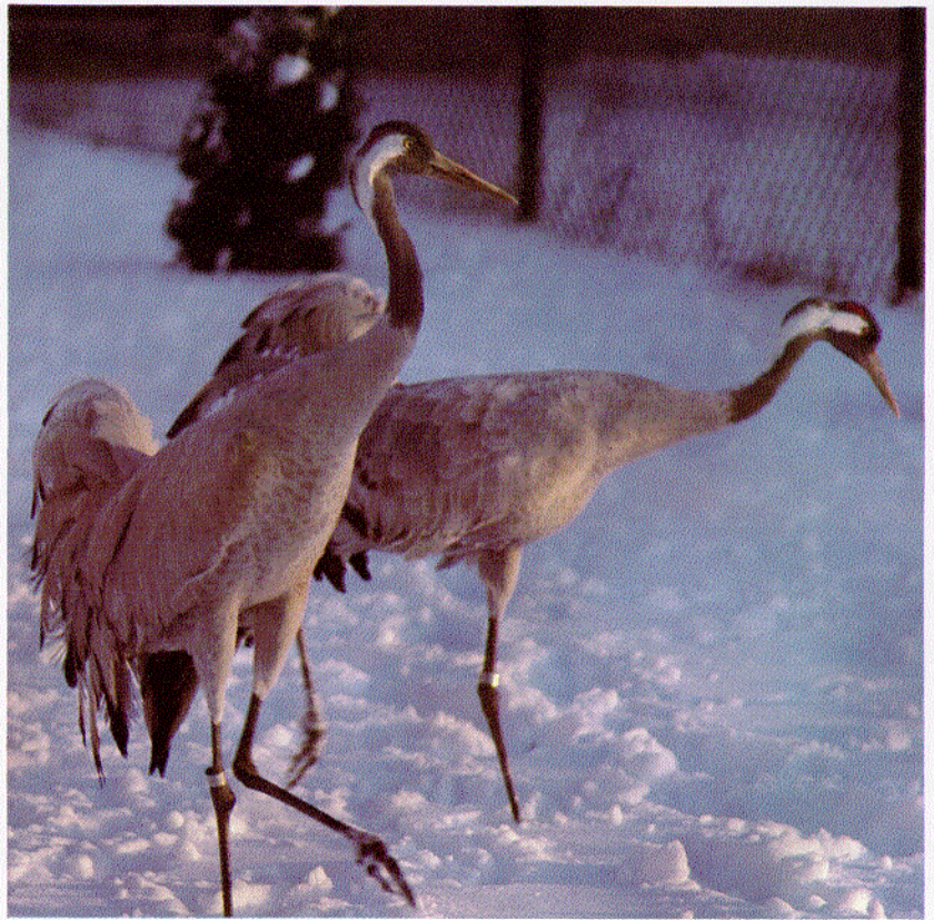
ICF's pair of Common Cranes threaten the photographer. Cranes are highly active through the winter.

Besides shelter, the only other requirement for winter is a diet supplement of corn, which not only keeps them warm and fat, but helps to trim their bills and tame them in prepara-