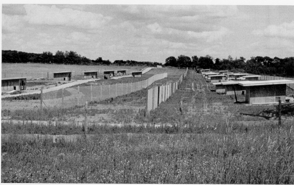
As the initial phase of "Crane City" nears completion, ICF's 24 new "cranedominiums" are readied. A service building will follow.