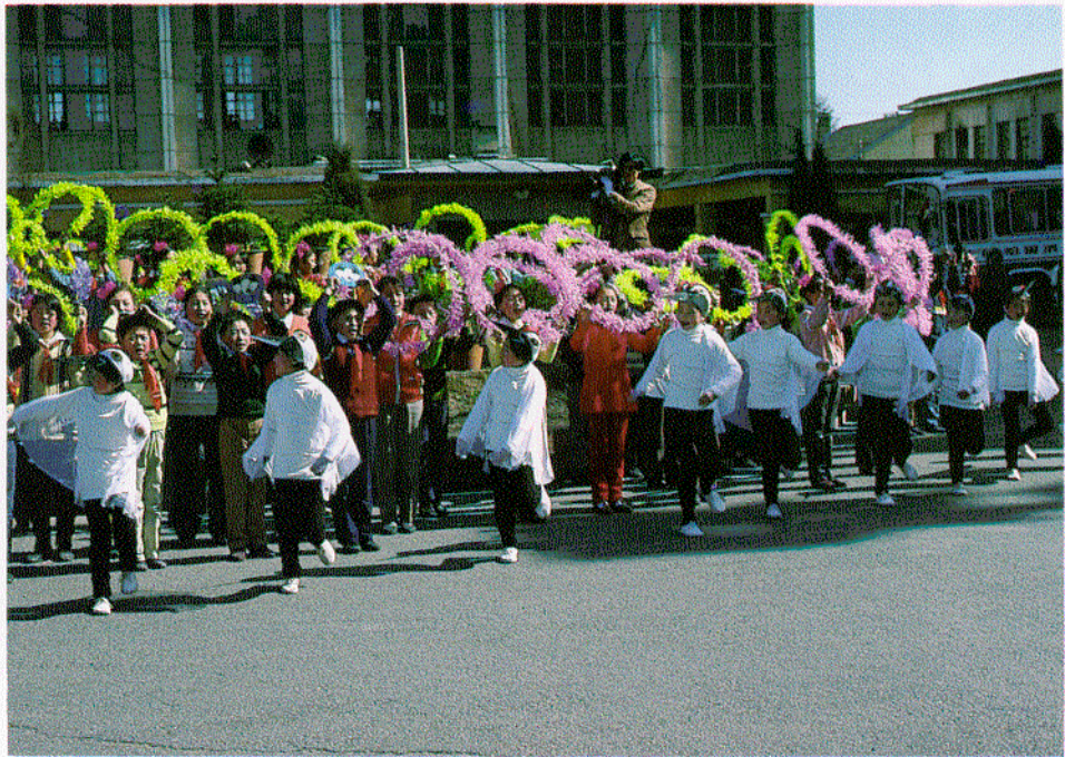
Above: crowds of children, including dancers dressed in white like Red-crowned Cranes, greeted ICW delegates at the Qiqihar train station. Below: 225 crane conservationists came from 28 nations to attend ICW.