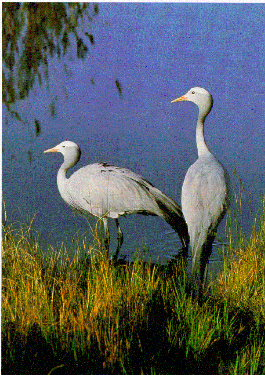
Citizen crane counts help to verify changes in crane populations worldwide. The Blue Crane, shown here, appears to be declining across its range.

The earliest known grassroots non-professional crane count is the winter count continued on page 2