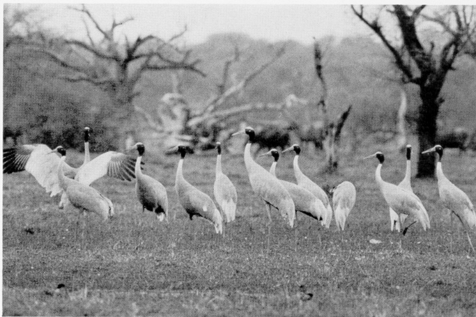
The Indian Sarus Crane, known as "the world's tallest flying bird," helps involve Indian crane counters in the protection of the extraordinary Keoladeo National Park.