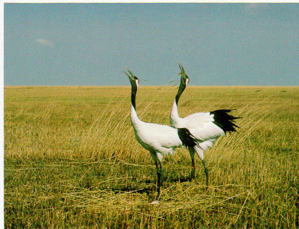
The number of nesting Red-crowned Cranes at Zhalong Marsh has declined, probably because of human disturbance. The future of cranes, especially in Asia and Africa, depends on balancing needs of wildlife and people on the wetland habitats that remain.

It would require a volume to describe the manifold transactions that took place during that week beside Zhalong Marsh. ICF will be compiling most of these plans — together with proposals from researchers not at ICW — into a Crane Action Plan that will provide direction for crane research and conservation for the years 1988-92. To mention just a few ICW outcomes, we anticipate an international winter count of Red-crowned Cranes; cooperative conservation work between India