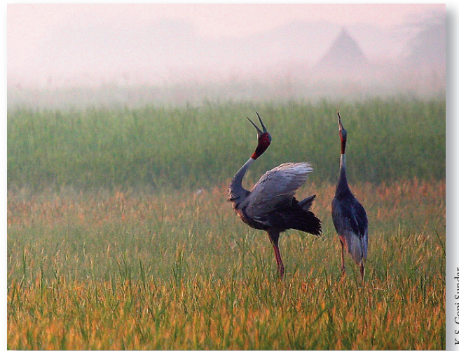
K.S. Gopi Sundar

ICF's programs based in India and Vietnam/Cambodia are working together to assess the status of the globally threatened Sarus Crane and its wetland habitats across its range, from India and Nepal, through Myanmar and the countries of Southeast Asia, to Australia. In South Asia, we are monitoring more than 1,000 crane pairs, and aided by an unusual rainfall pattern in 2013-14, we recorded the highest ever breeding success for Sarus Cranes. The future of the Sarus Crane across its range is closely tied to the preservation of small wetlands, often on densely populated, agricultural landscapes. ICF's Vietnamese and Cambodian teams, working with a network of universities, are mapping their countries' wetlands, identifying threats from aquaculture, rubber plantations, and other development, and designing opportunities for industries to adopt crane-friendly management practices.