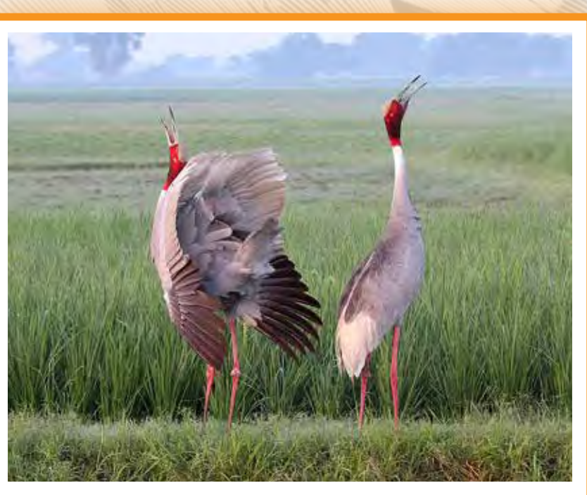
Sarus cranes unison call in rice fields in India

International Crane Foundation, Baraboo, Wisconsin, USA / Nature Conservation Foundation, Mysuru, India Email: gopi@savingcranes.org and gopi.sundar@gmail.com