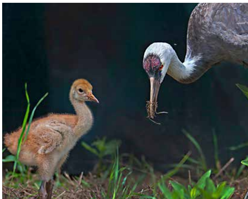
Hooded Crane teaching its chick to forage

2 Severtsov's Institute of Ecology and Evolution, RAS, Moscow, Russia Email: eilyashenko@savingcranes.org