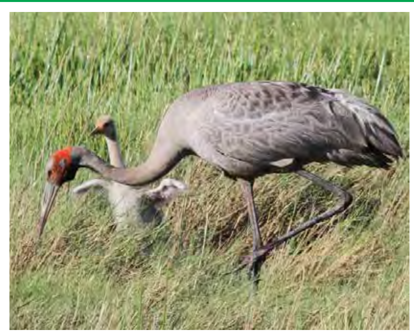
Brolga and chick in breeding habitat near Normanton, Queensland, Australia

<sup>2</sup>International Crane Foundation, Baraboo, Wisconsin, USA / Nature Conservation Foundation, Mysuru, India Email: gopi@savingcranes.org