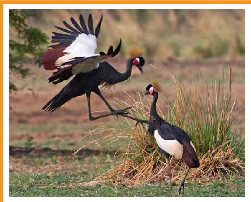
Black Crowned Cranes in a courtship dance at Zakouma National Park in Chad

International Crane Foundation, Baraboo, Wisconsin, USA / Endangered Wildlife Trust Partnership, Johannesburg, South Africa Email: kerrynm@ewt.org.za