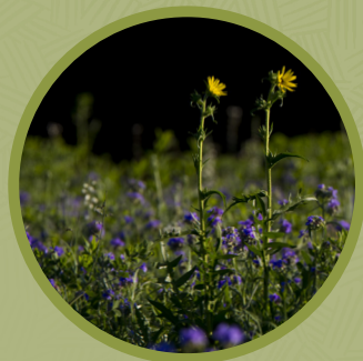
Compass Plant Silphium laciniatum Blooms from June to August