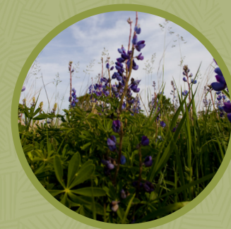
Wild Lupine Lupinus perennis Blooms in May and June

Walking trails only. Please do not take scooters, wheelchairs, bicycles, or strollers onto trails. Thank you!