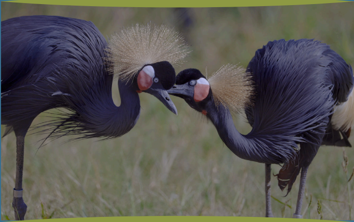
Black Crowned Cranes Spirit of Africa