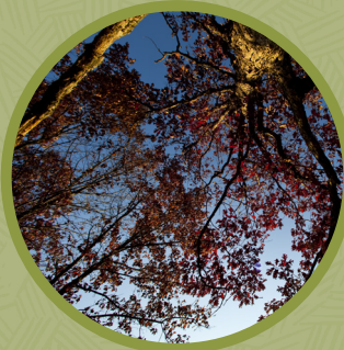
White Oak Quercus alba Leaves in autumn