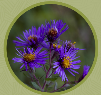
New England Aster Symphyotrichum novae-angliae Blooms from August to October