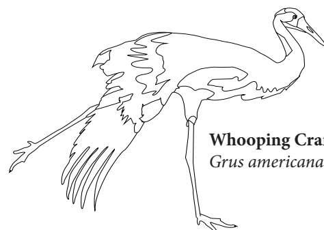
Whooping Crane Grus americana