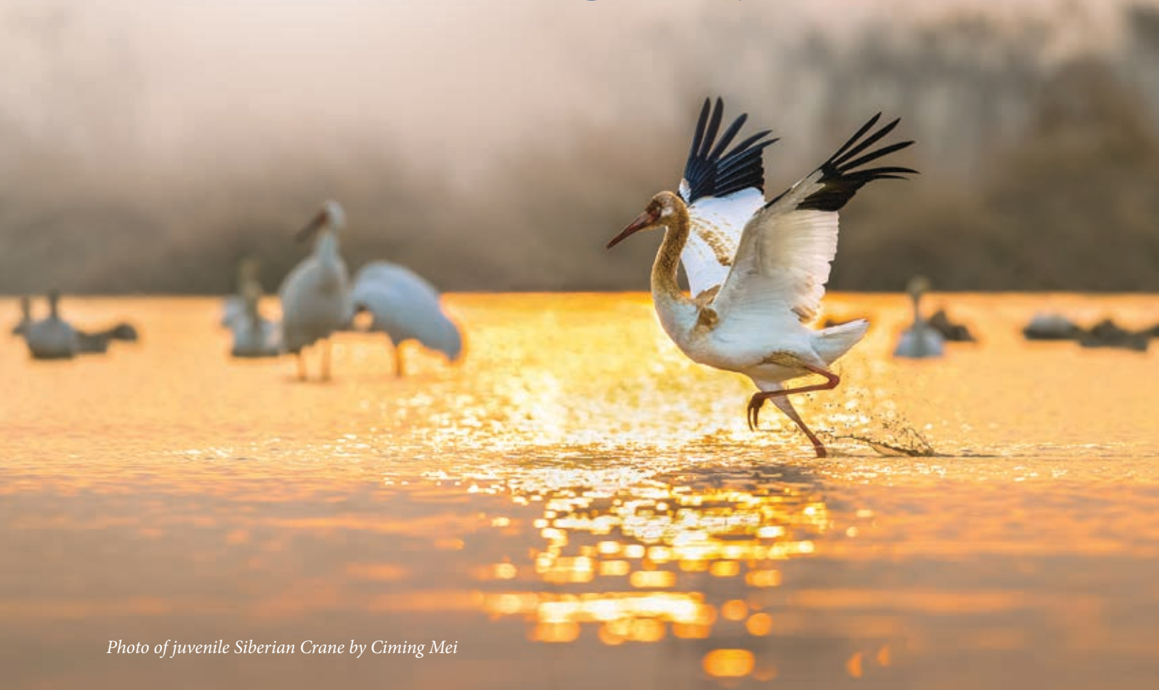
Photo of juvenile Siberian Crane