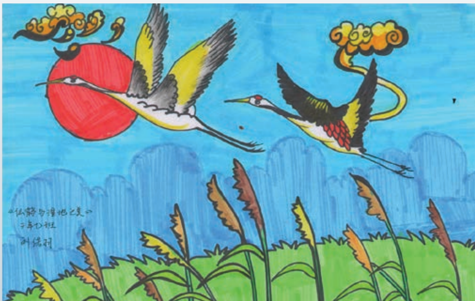
Art by Liu Ruoyu

Organizing international environmental education exchange activities on the theme of crane conservation will help improve the public's awareness of protecting cranes and wetlands and will promote collaboration between countries in nature conservation and cultural communication.