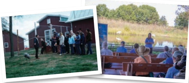
Public tour circa 1973 and 2021

We have made great progress in the past 50 years, but we're just getting started. The work we do today impacts the world we leave to the next generation.