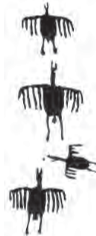
A pictograph of flying cranes Nogales Cliff House, New Mexico courtesy of Stewart Peckham

A pictograph is a picture or drawing painted on a rock, and a petroglyph is a picture that is carved on rock.