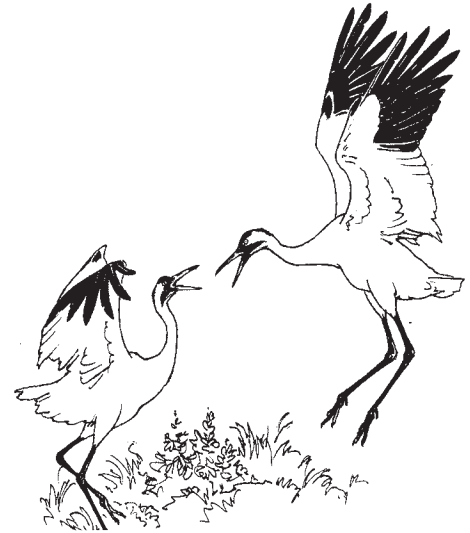
Whooping Cranes dancing

People have been performing crane dances for thousands of years. For example, people in western Sweden painted pictographs of dancers performing a crane dance over 5,000 years ago! In Australia, the Aboriginal people have incorporated crane dances into their corroborees , or traditional ceremonies that reenact the history of tribes. In one Aboriginal tribe in Australia, only the men perform the “Dance of the Brolga.” The men paint their bodies with traditional designs and wear a headdress made of bird feathers. As they dance, they mimic the calls of the crane and copy the movements of the bird using their bodies. In contrast, among the Ainu of Japan, the women perform the crane dance. The Ainu women hold their shawls around themselves to look like the wings of a crane and, like the Aboriginal people, copy the calls of the crane as they dance.