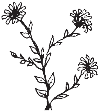
Asters are native prairie plants in North America.

The following excerpt is from an account by a member of the Cree Red Earth Band in western Canada on the history of Whooping Cranes near the Red Earth Indian Reserve in Saskatchewan. The Whooping Crane no longer breeds in this region today, but the birds still lived in the region when the reserve was created in mid-1800s. The individual's account describes observations of the Whooping Crane, or waapichichaak in Cree, made by himself when he was a young man in the early 1900s and by his grandfather, possibly in the late 1800s. Note that he describes the habitat where the crane lives, its nesting behavior, hunting of the Whooping Crane by the Cree, and the eventual disappearance of the Whooping Crane from the region.