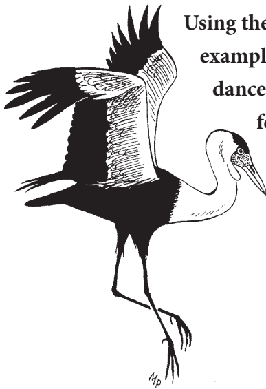
Wattled Cranes leaping (above) and bowing (right)