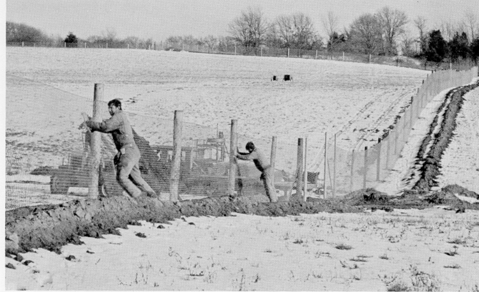
As a first step in the construction, the entire perimeter fence went up this fall. It will keep predators and unauthorized people away from the breeding cranes.

To purchase packets, or to arrange a field trip, contact the Education Coordinator at ICF.