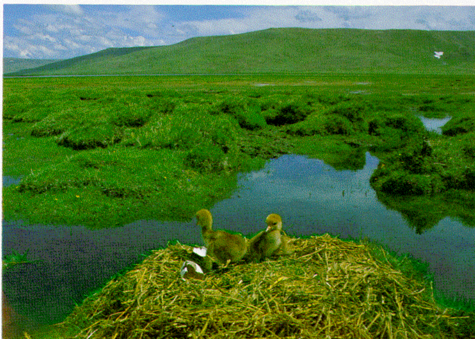
Two Black-necked crane chicks survey the world from their nest atop a grassy mound in Longbaotan Marsh, China.