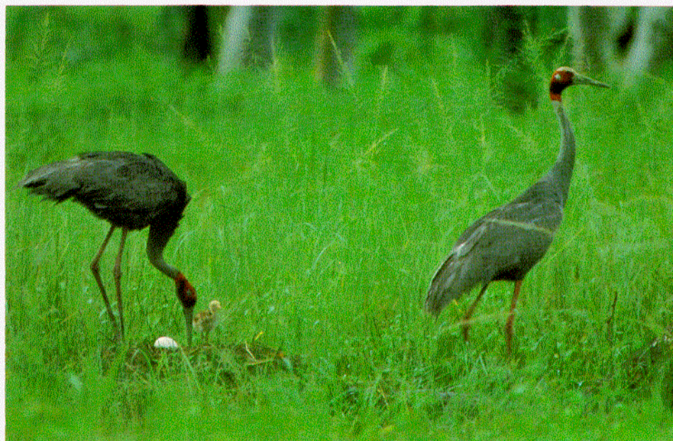
Eastern Sarus Cranes still nest in northern Australia. Recent reports from Vietnam represent the first verified evidence in recent years that the cranes also survive in southeast Asia.