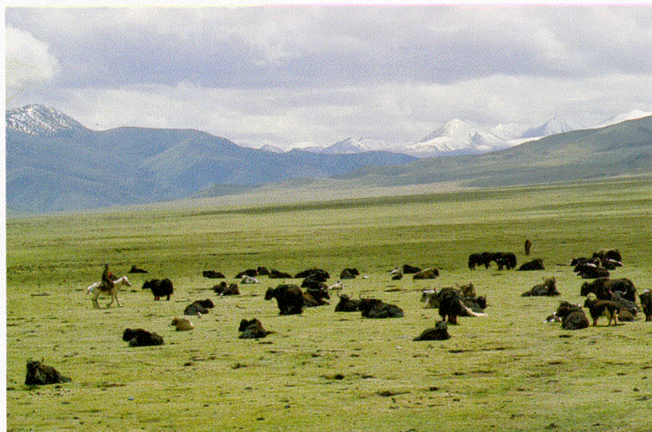
Over 2,000 cattle, yaks, sheep, and horses are pastured around the Longbaotan Marsh. Black-necked Cranes will forage among the herds without fear.

Both male and female incubate the eggs. When one bird is sitting on the eggs, the other is on watch nearby. At one nest we observed, the birds traded places five to six times during daylight, but seldom on rainy and cloudy days. When temperatures rose in the afternoon, both parents would leave the nest for feeding so that the eggs might be exposed for