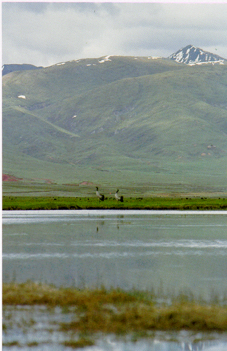
The crane pairs are highly territorial. Longbaotan Marsh is large enough to support eight crane families.

The number of Black-necked Cranes breeding at Longbaotan is relatively stable.