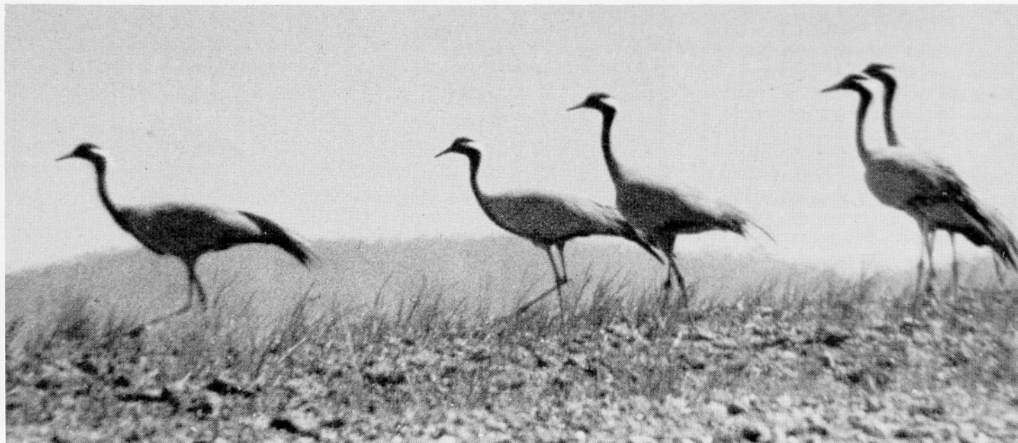
In extremely arid parts of East Kazakhstan, Demoiselle Cranes nest in areas used for livestock grazing.

Here, too, some new aspects of Demoiselle interrelations with human activity have appeared. First, at the same time that cultivation has increased in the steppe zone, cattle